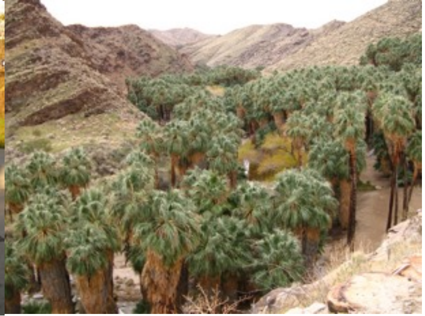
Dog, Bus, Palm Tree, 2011 research photo