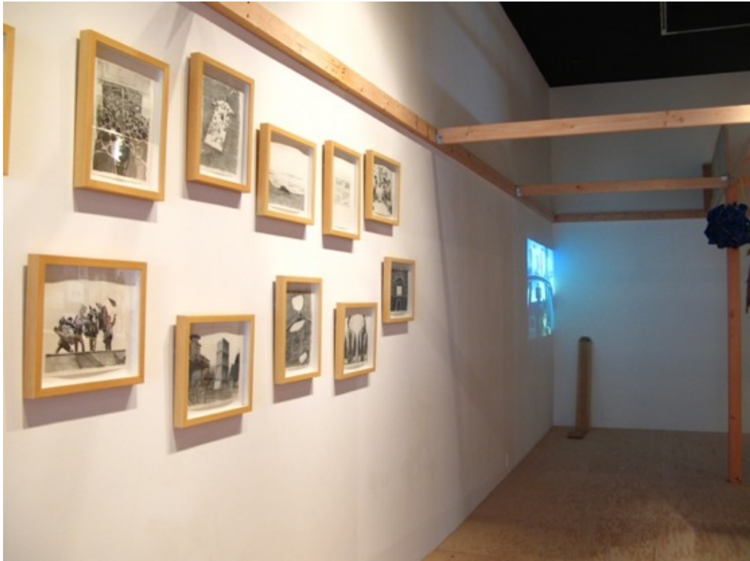
Nothing related, but something could be associated, Yerba Buena Center for the Arts, San Francisco, 2010