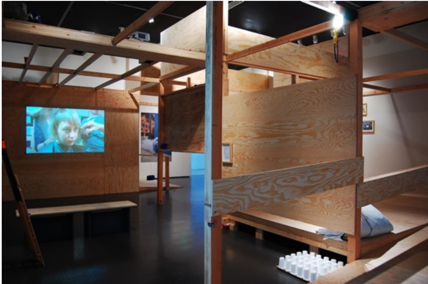
Nothing related, but something could be associated, Yerba Buena Center for the Arts, San Francisco, 2010