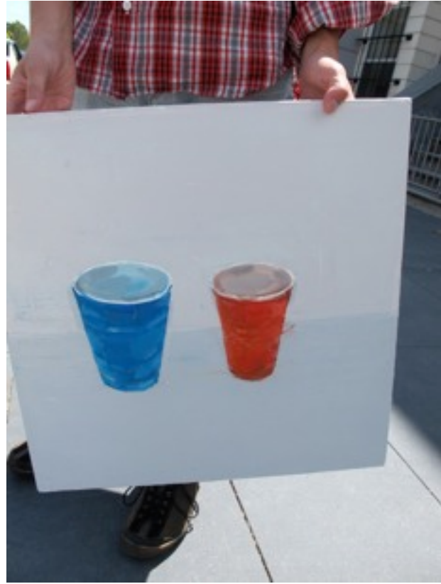
pinging to a public(thrift store), 2010