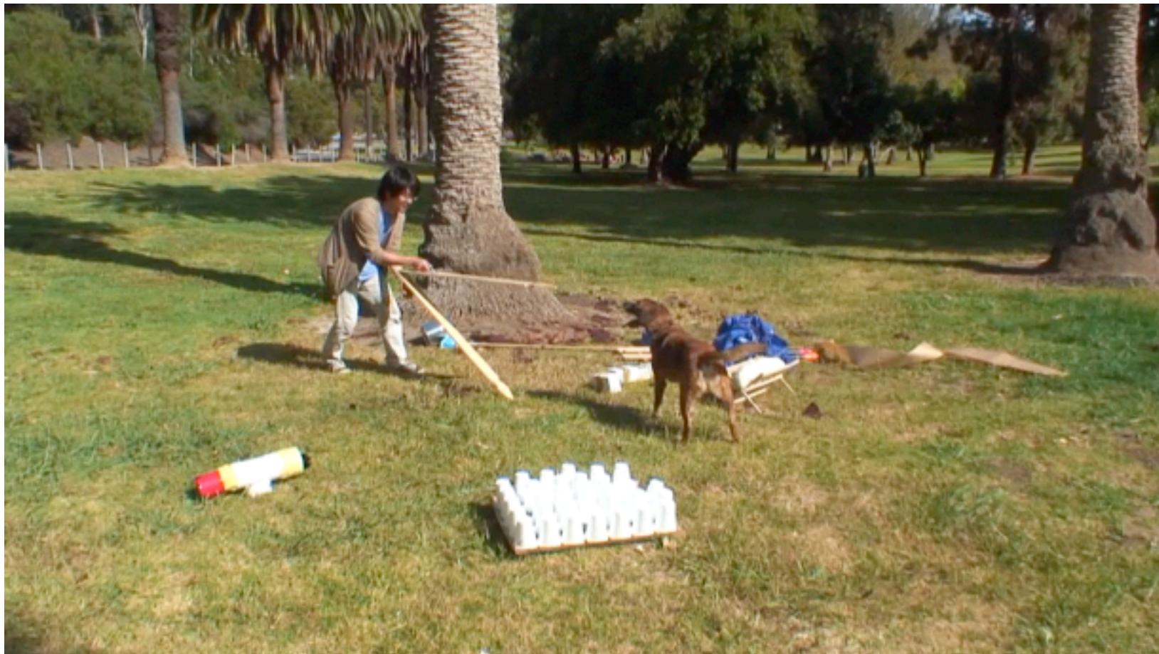
showing objects to a dog, 2010