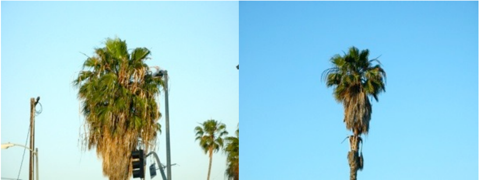
Dog, Bus, Palm Tree, 2011 research photo