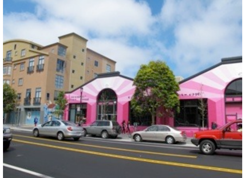
painting to a public(thrift store), 2010