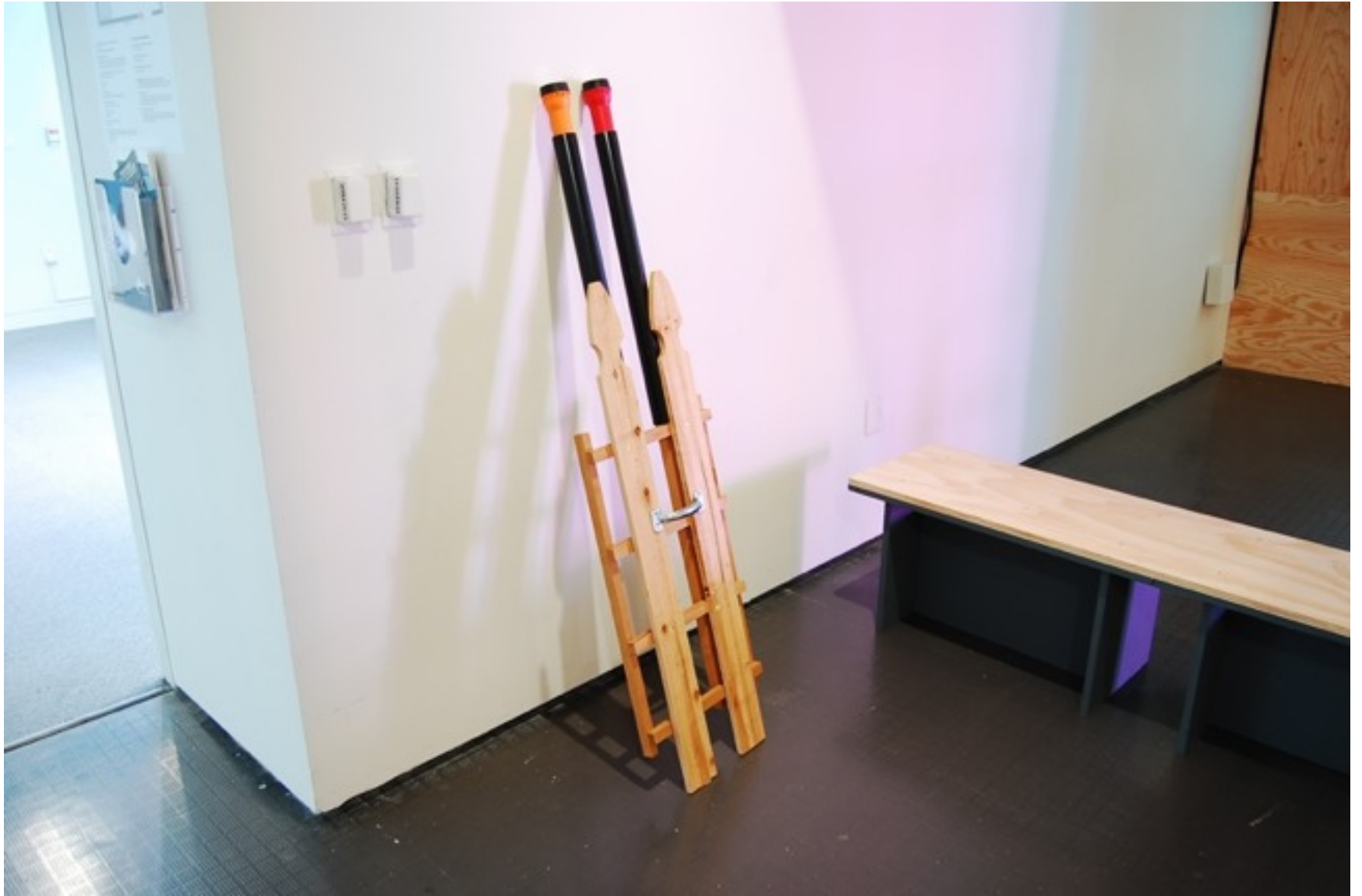
Nothing related, but something could be associated, Yerba Buena Center for the Arts, San Francisco, 2010