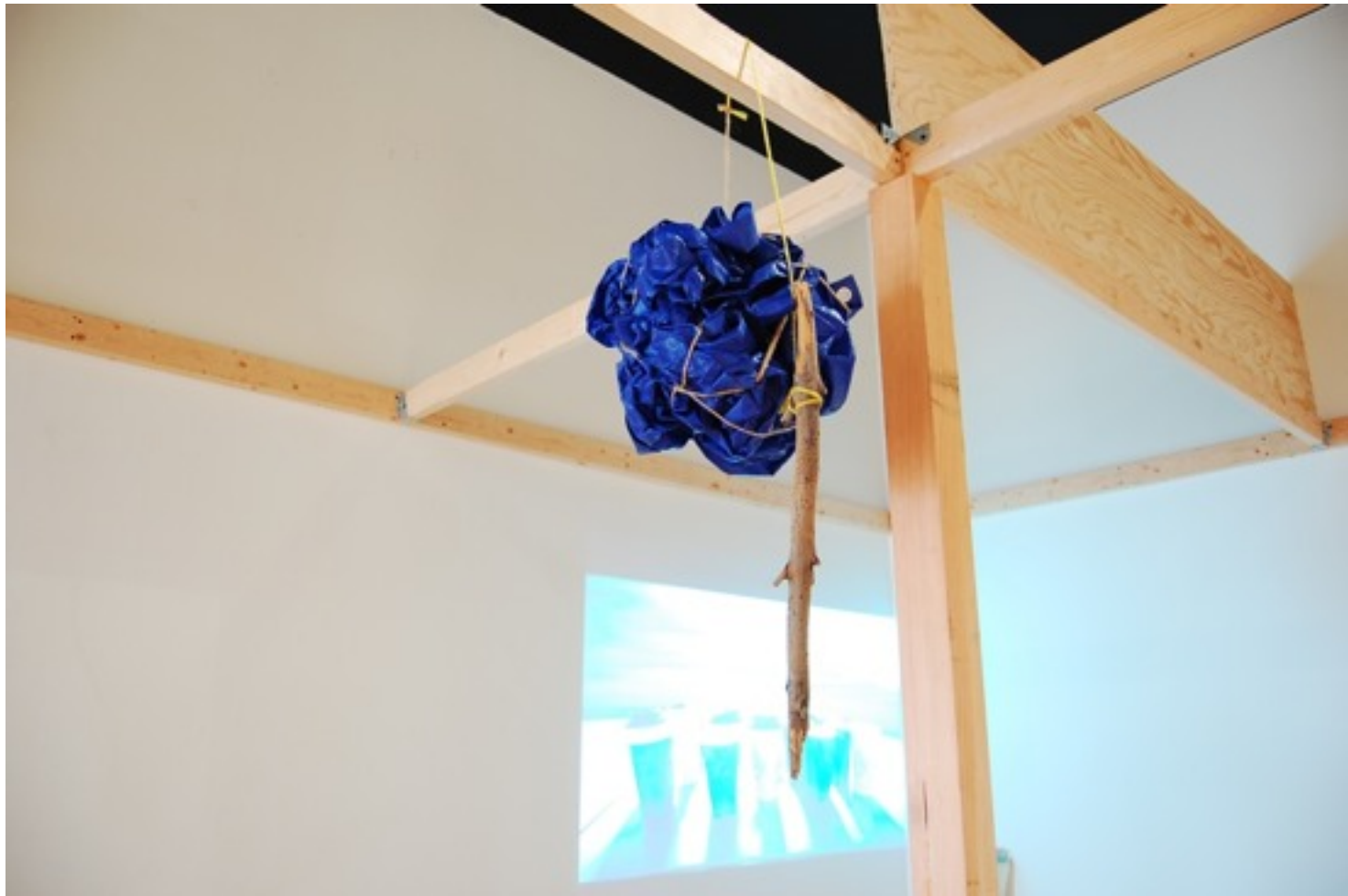
Nothing related, but something could be associated, Yerba Buena Center for the Arts, San Francisco, 2010