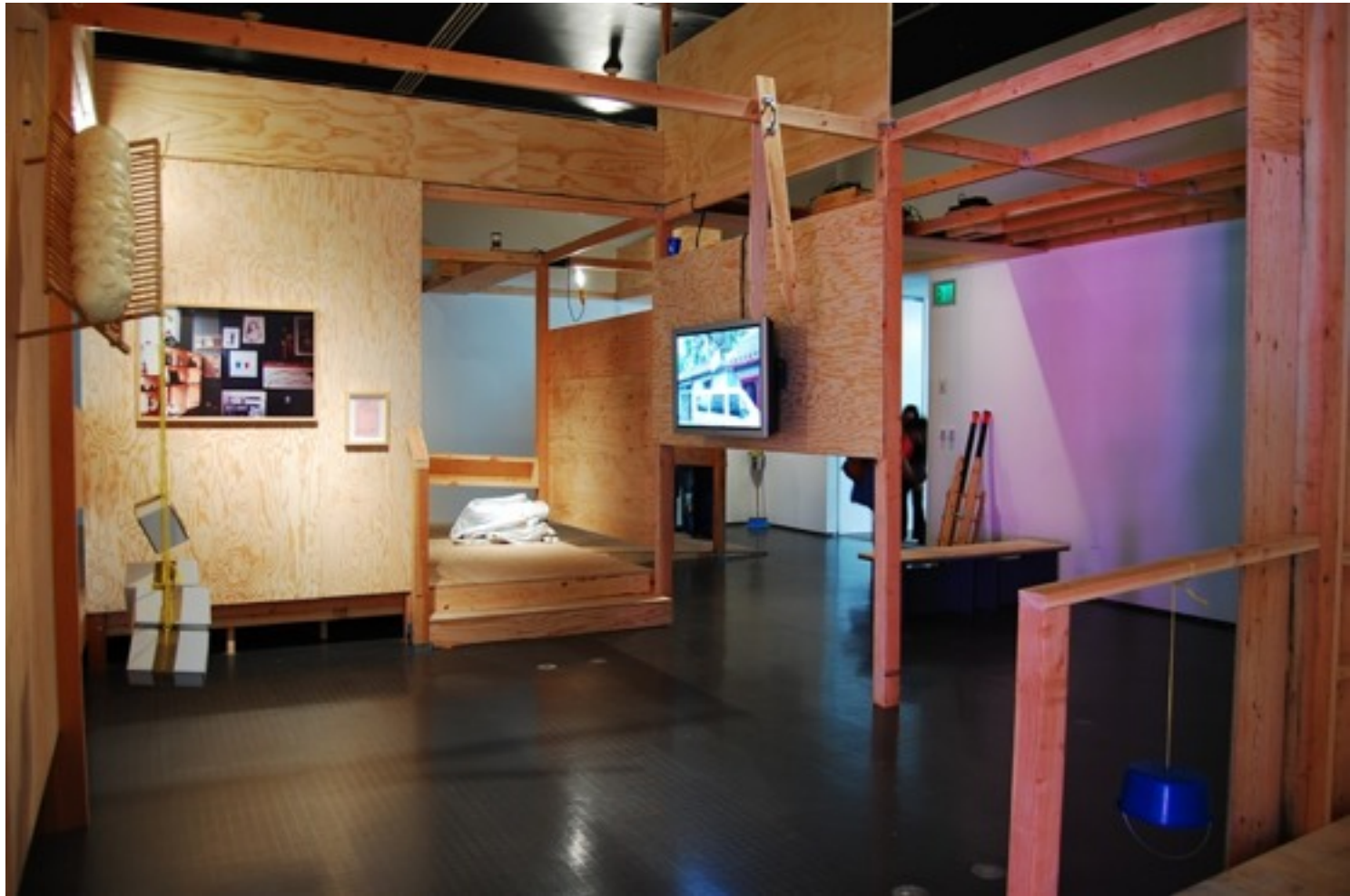
Nothing related, but something could be associated, Yerba Buena Center for the Arts, San Francisco, 2010