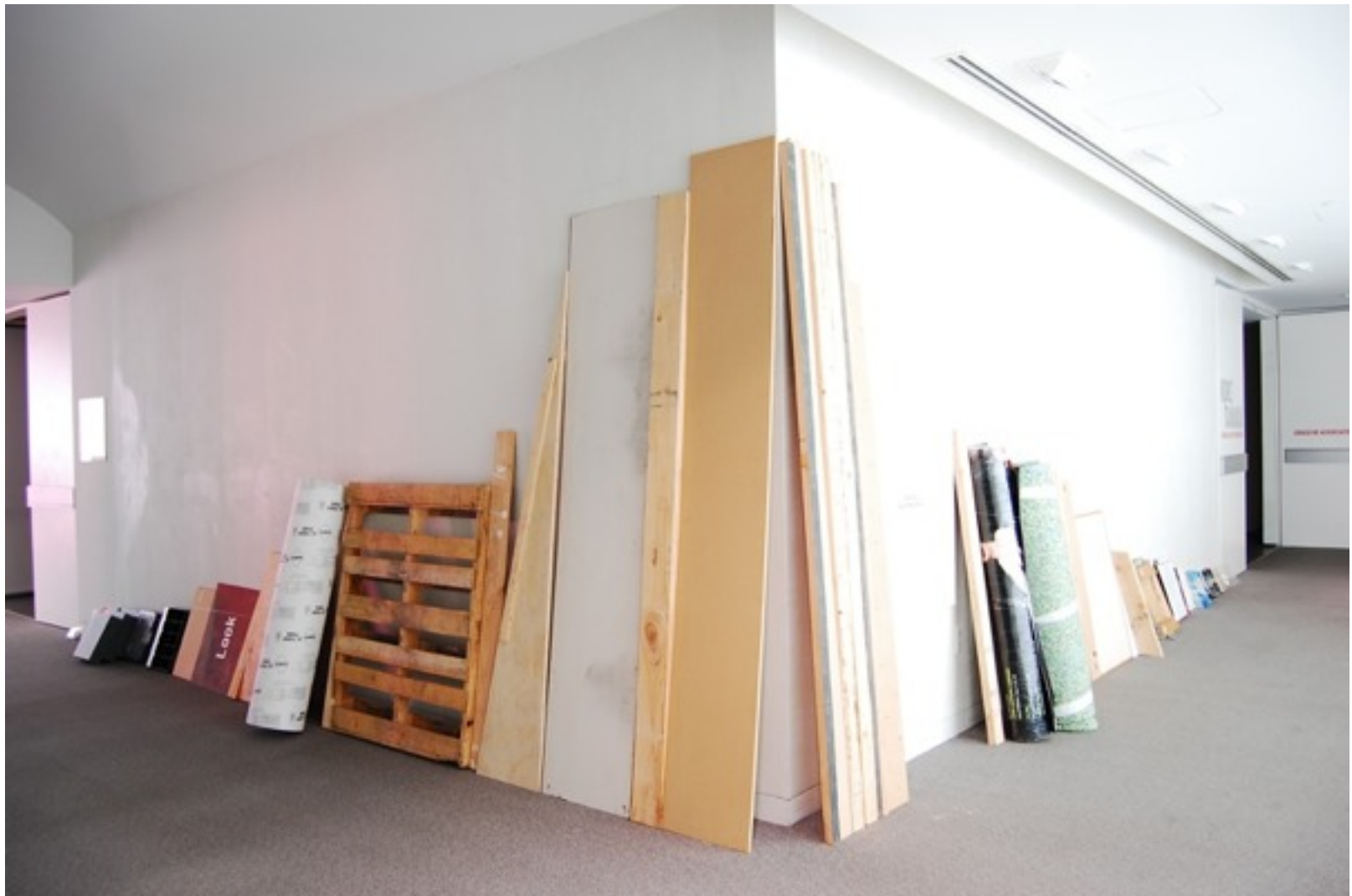
from something small to something large /portrait of space, 2010