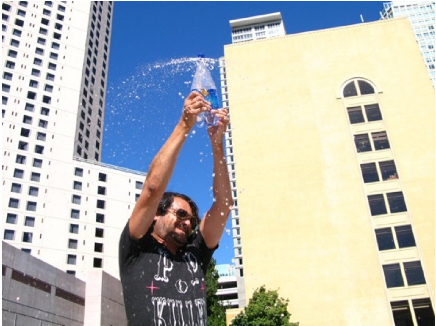
workshop, “names”, “chairs”, “Sparkling Water”