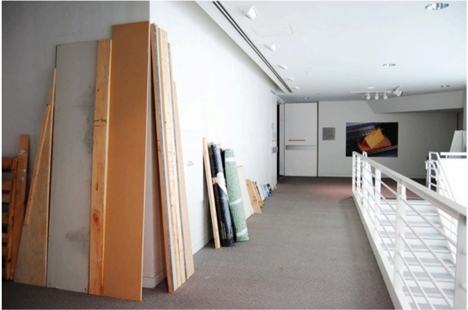
Nothing related, but something could be associated, Yerba Buena Center for the Arts, San Francisco, 2010