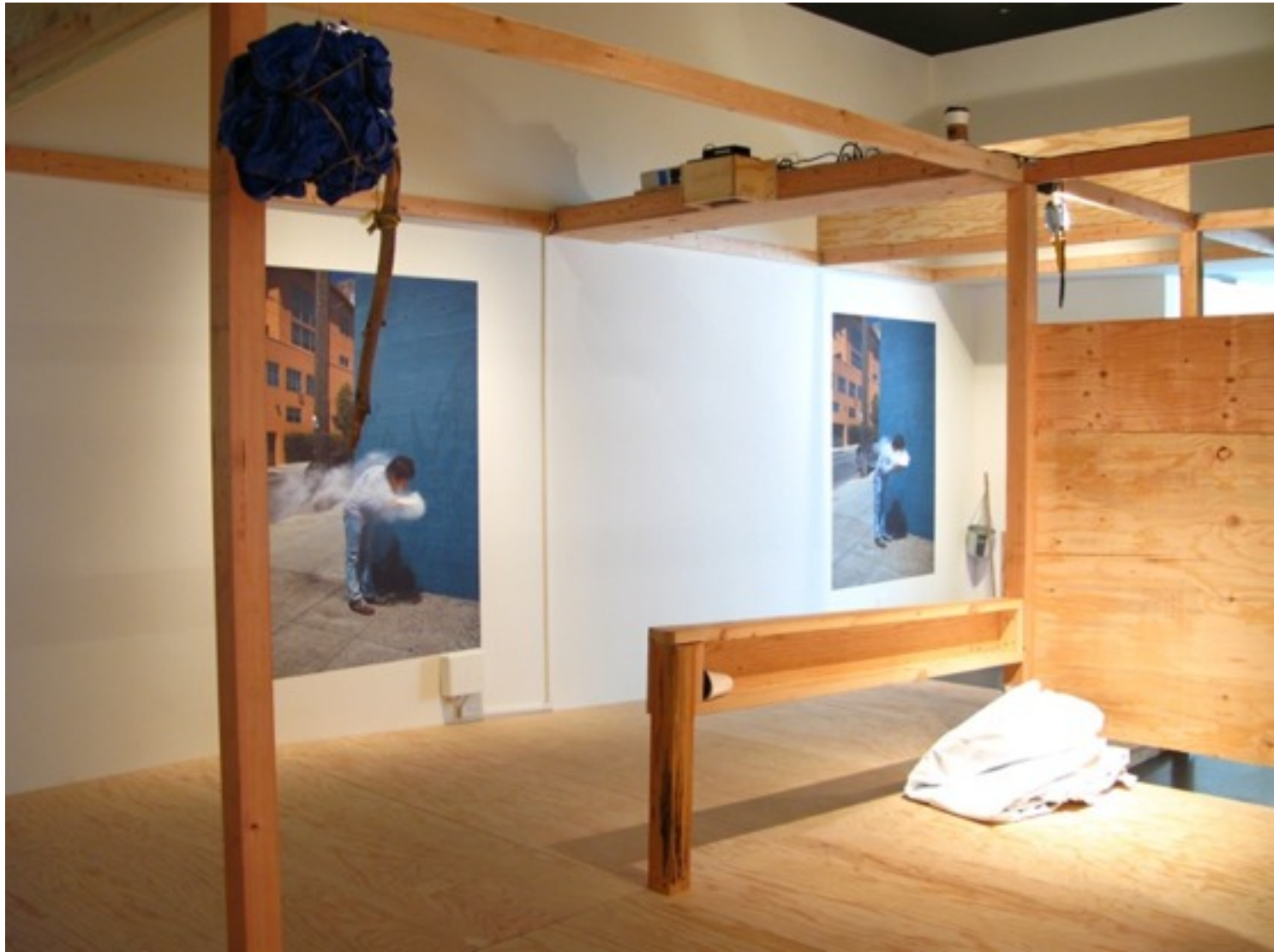
Nothing related, but something could be associated, Yerba Buena Center for the Arts, San Francisco, 2010