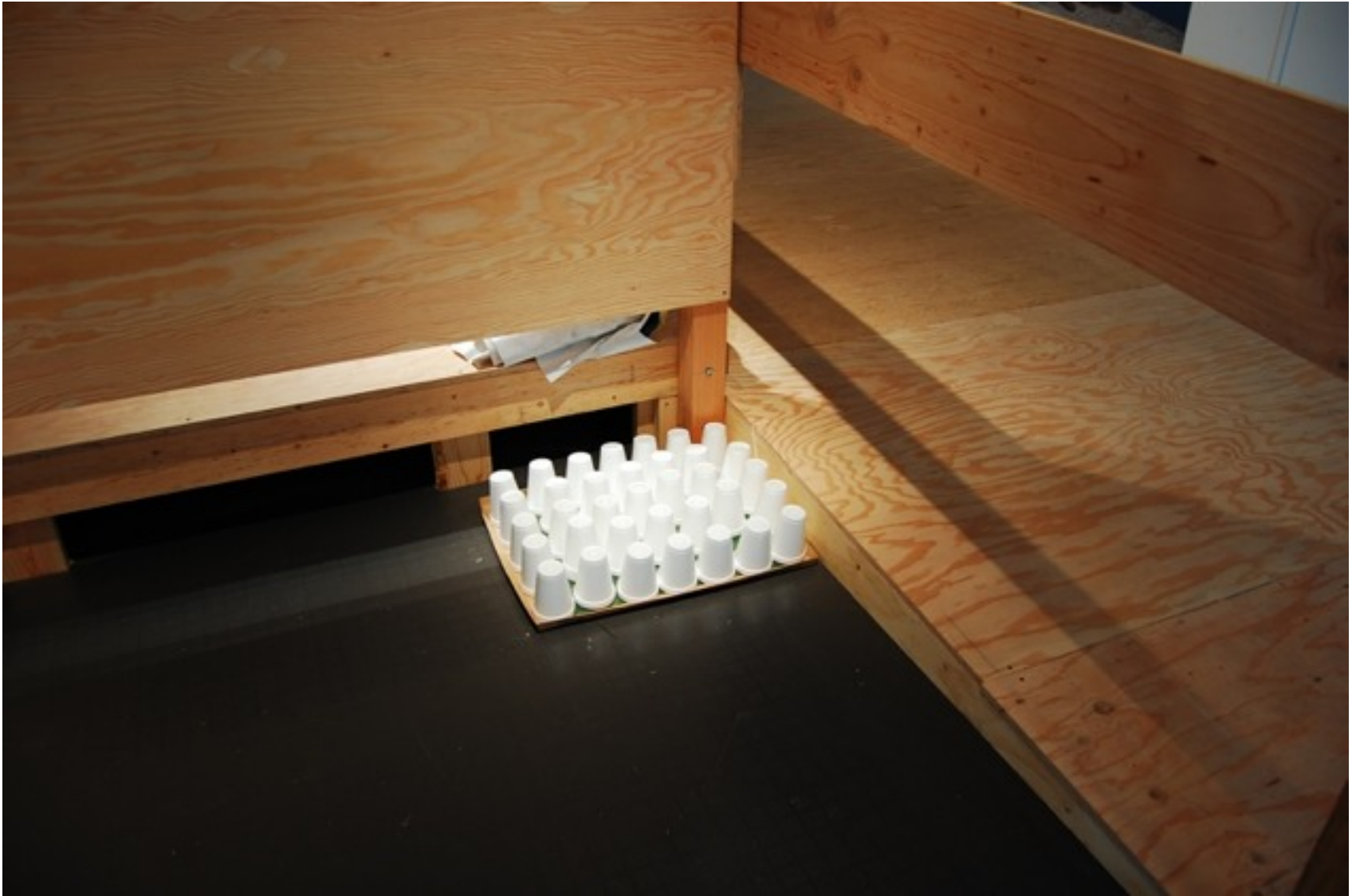
Nothing related, but something could be associated, Yerba Buena Center for the Arts, San Francisco, 2010