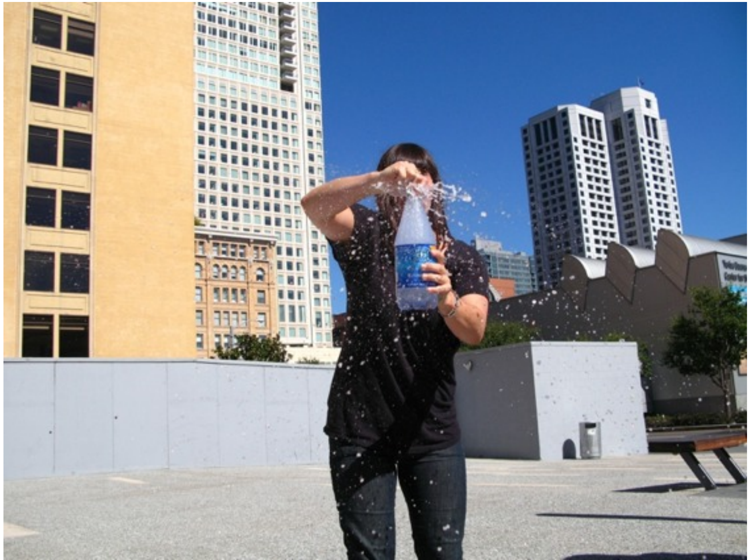
workshop, “names”, “chairs”, “Sparkling Water”