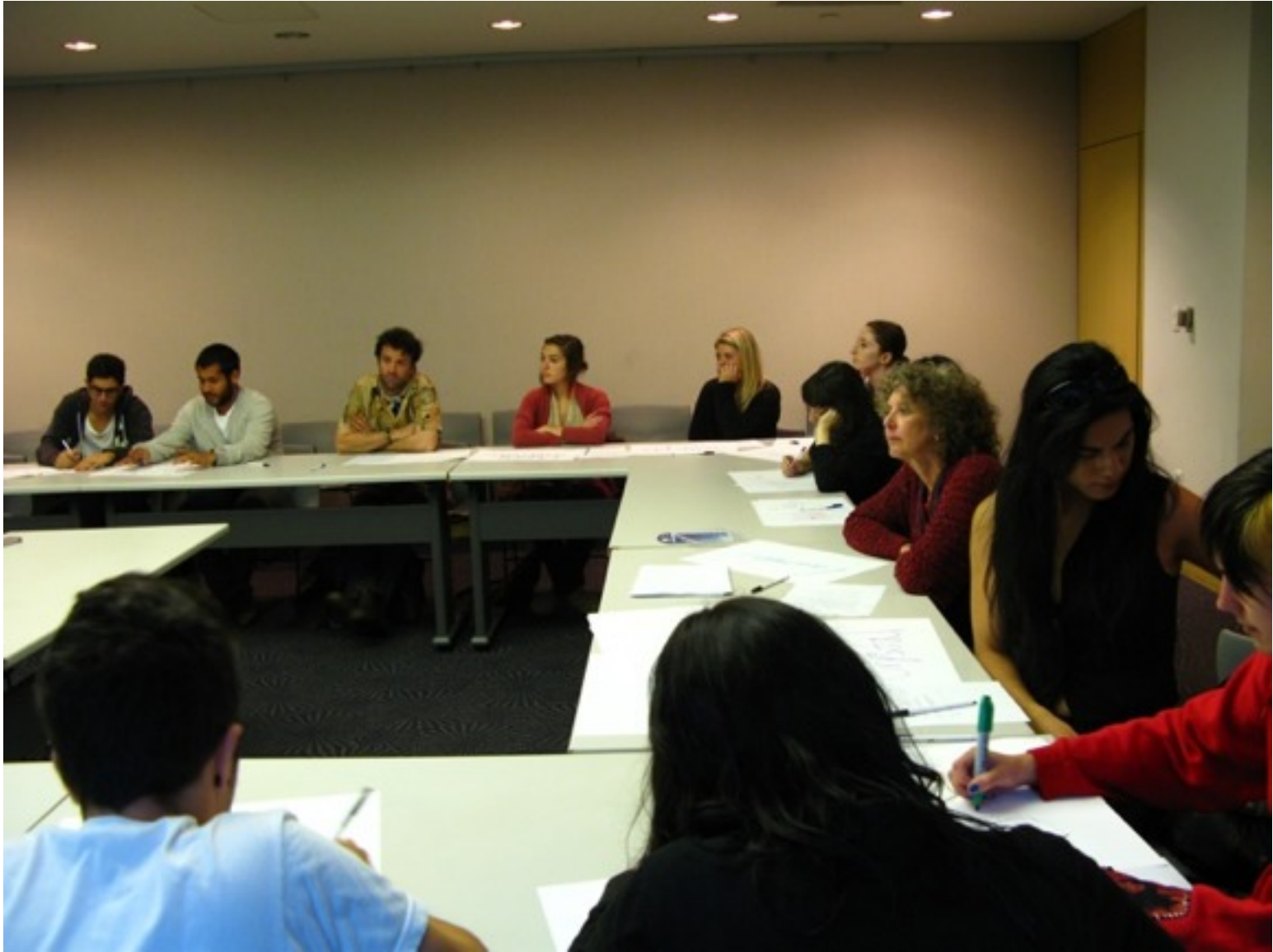
workshop, “names”, “chairs”, “Sparkling Water”