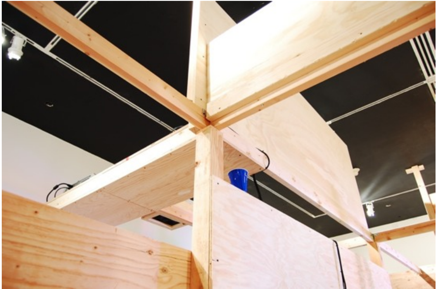
Nothing related, but something could be associated, Yerba Buena Center for the Arts, San Francisco, 2010