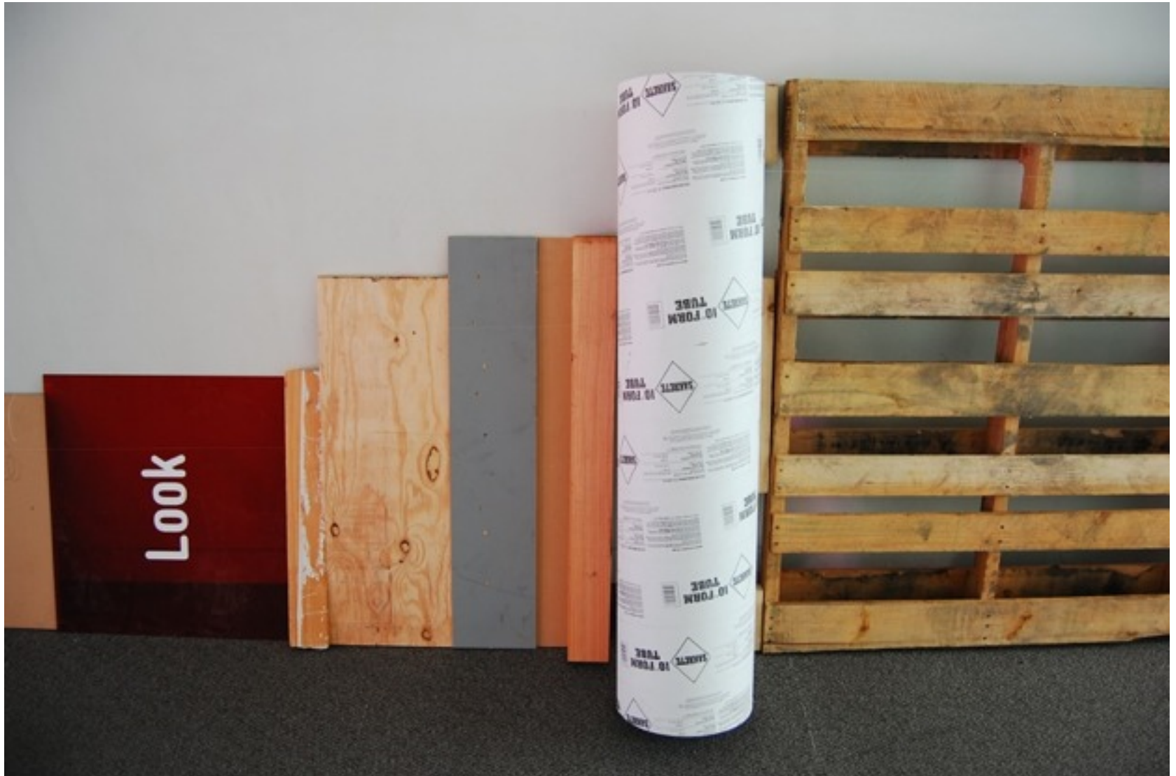
from something small to something large /portrait of space, 2010