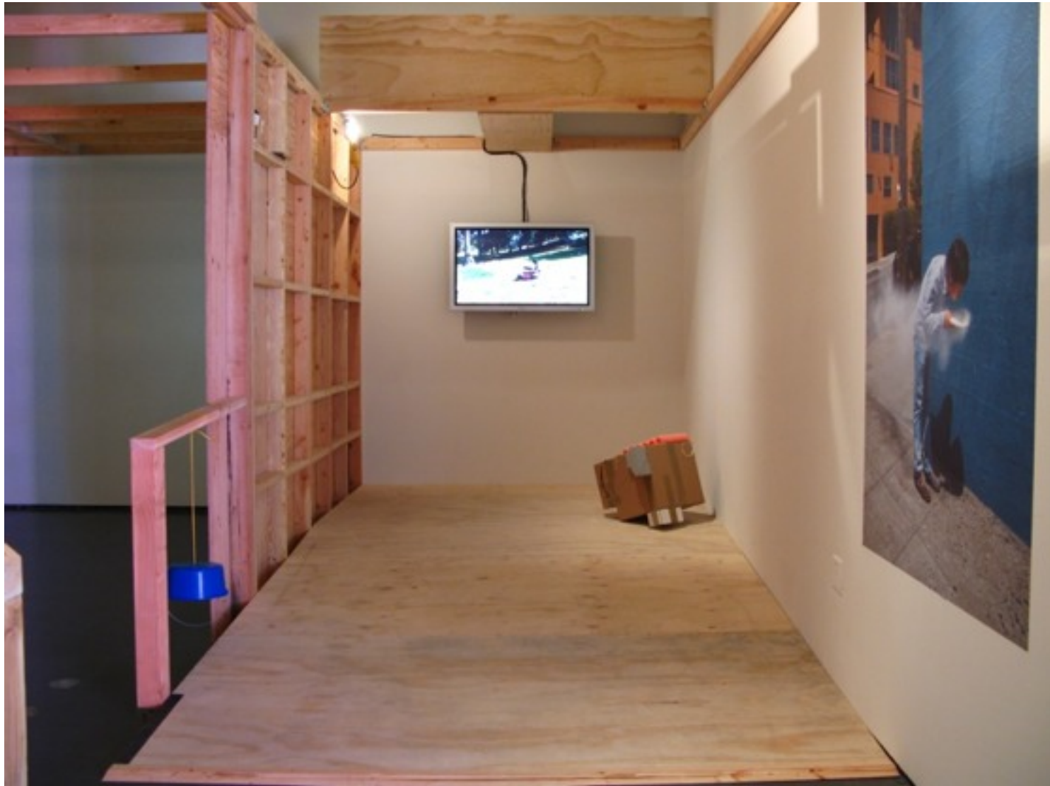
Nothing related, but something could be associated, Yerba Buena Center for the Arts, San Francisco, 2010