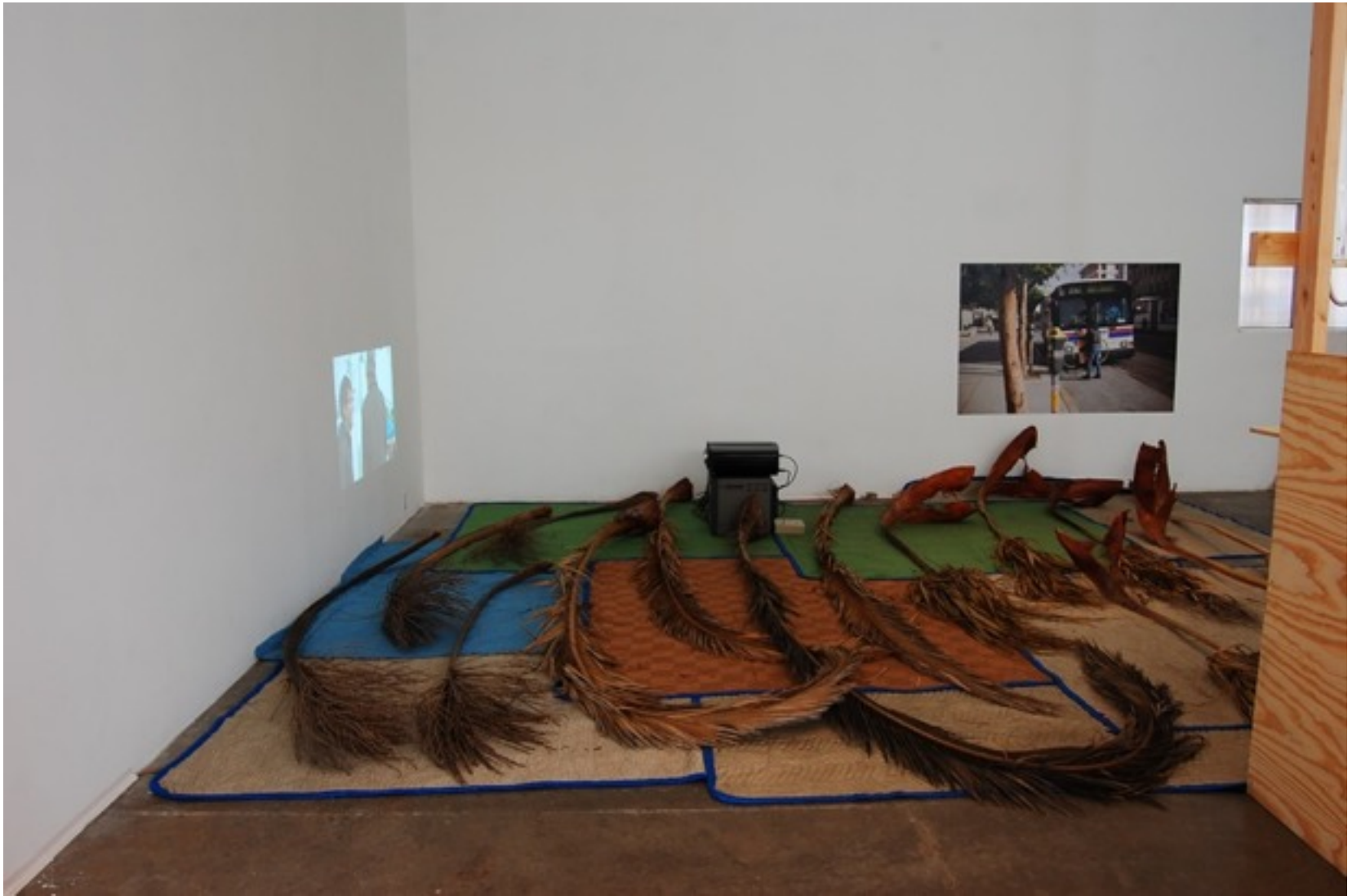
Dog, Bus, Palm Tree, 2011