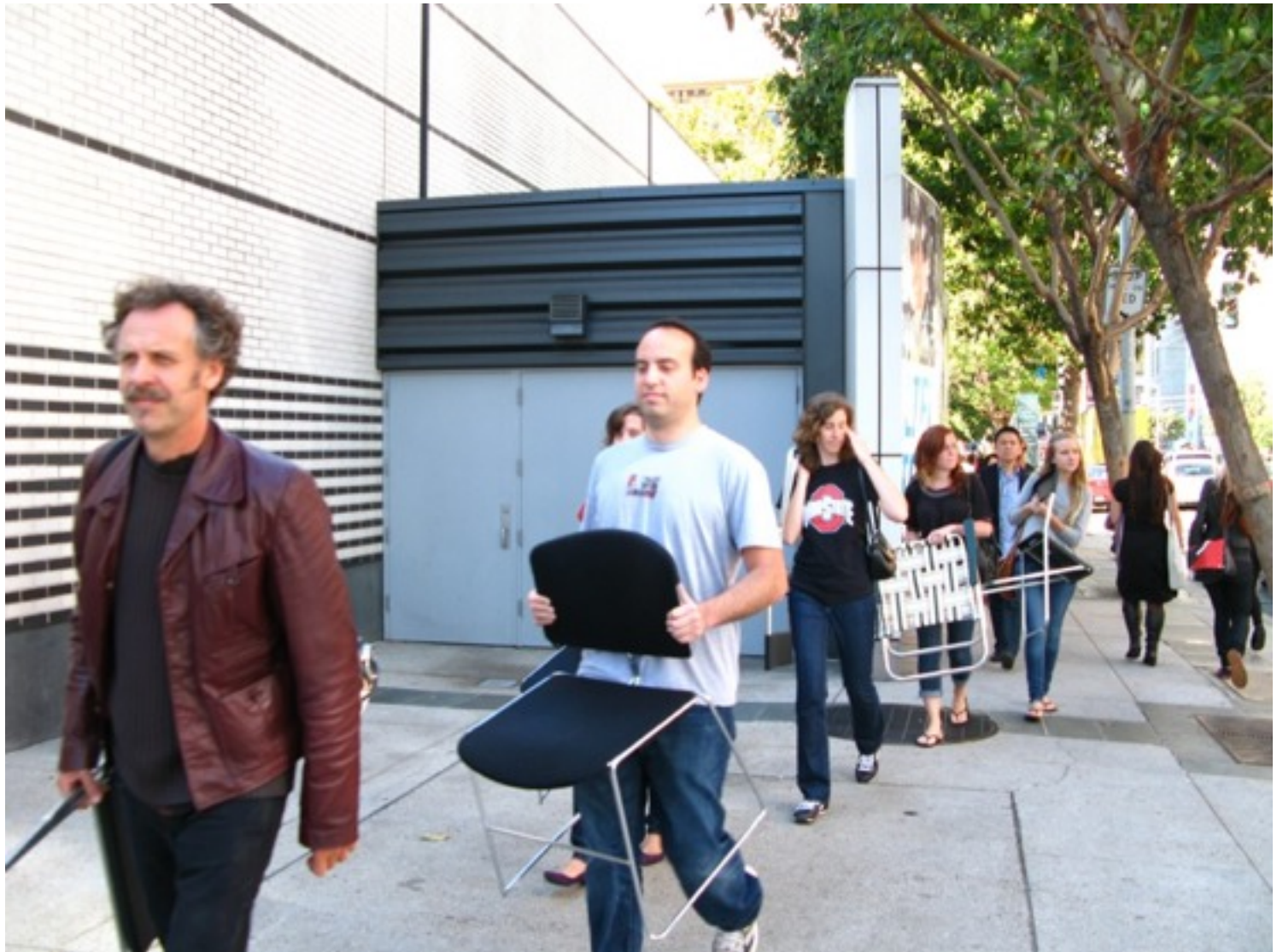
workshop, “names”, “chairs”, “Sparkling Water”