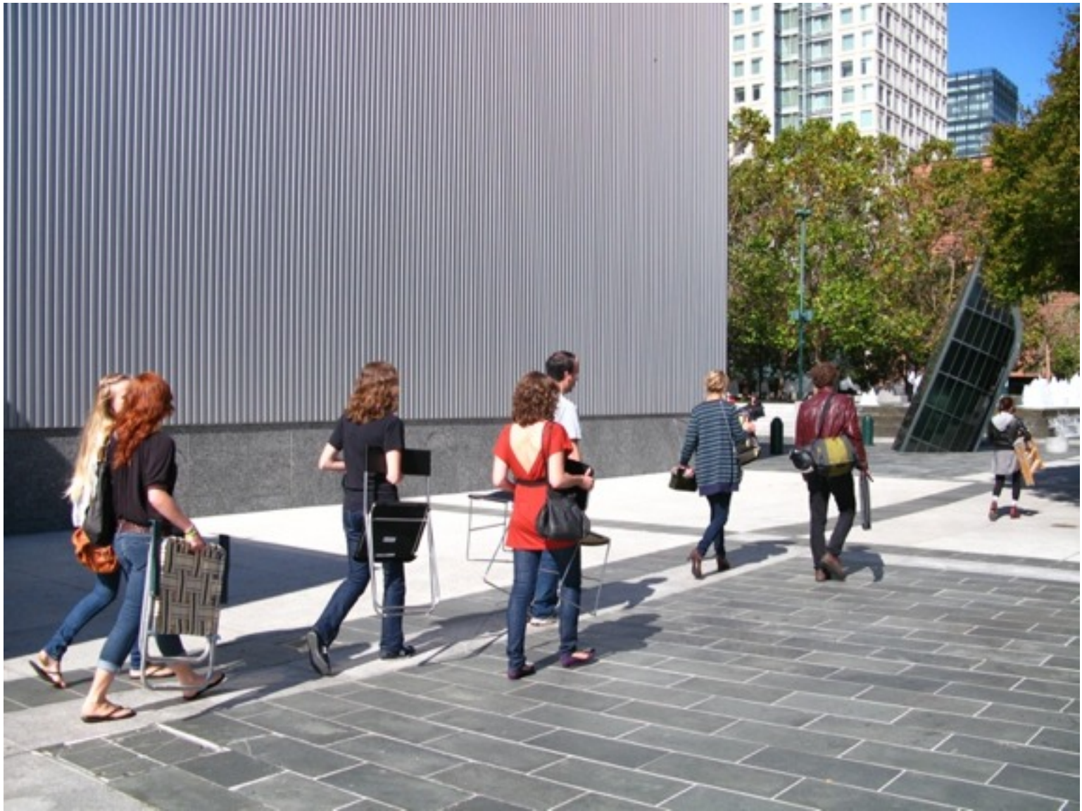
workshop, “names”, “chairs”, “Sparkling Water”