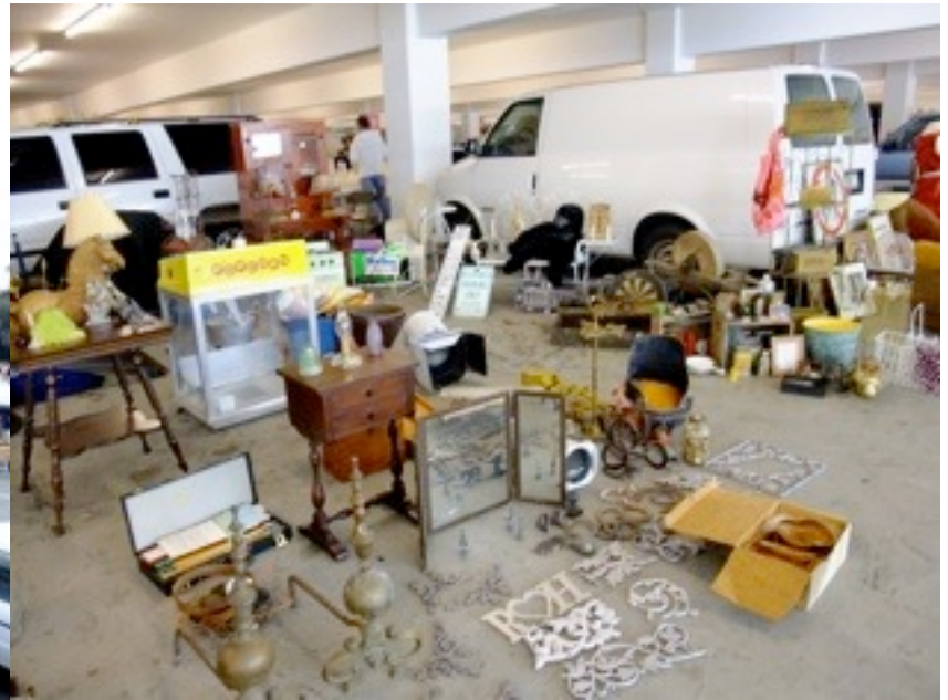
Someone's junk is someone else's treasure., 2011