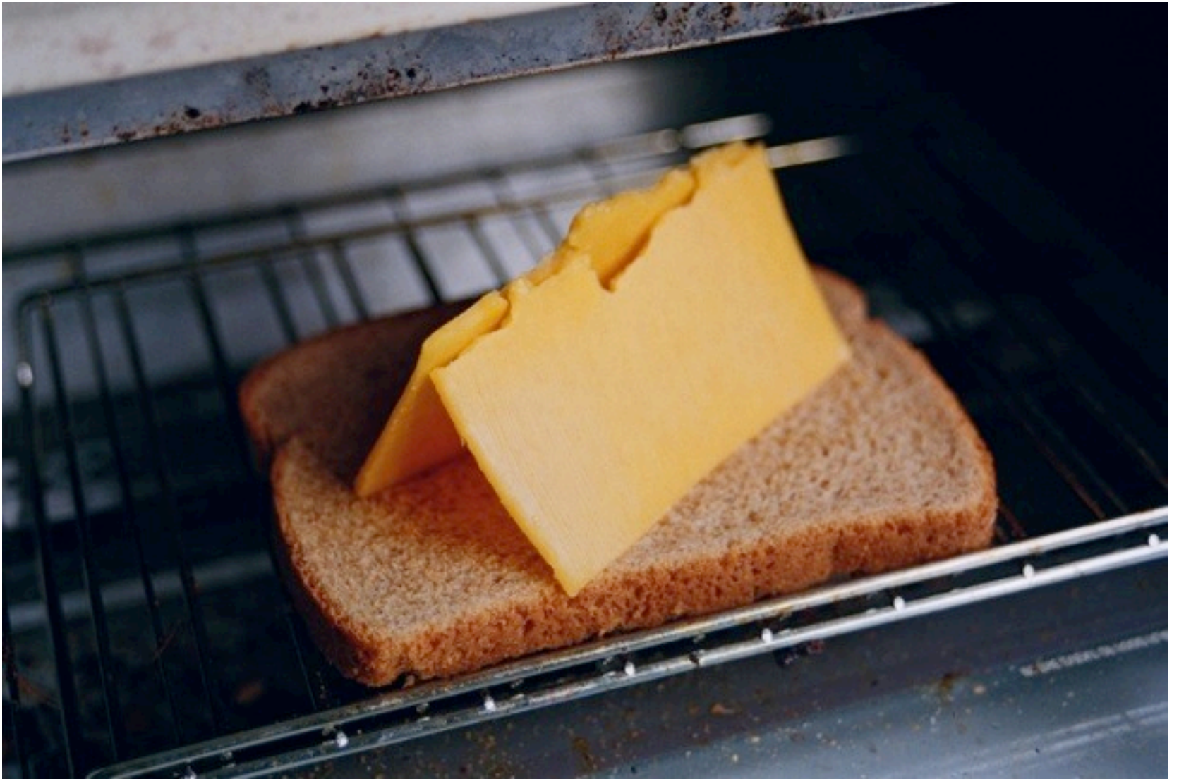
everyday statement (cheese toast), 2010