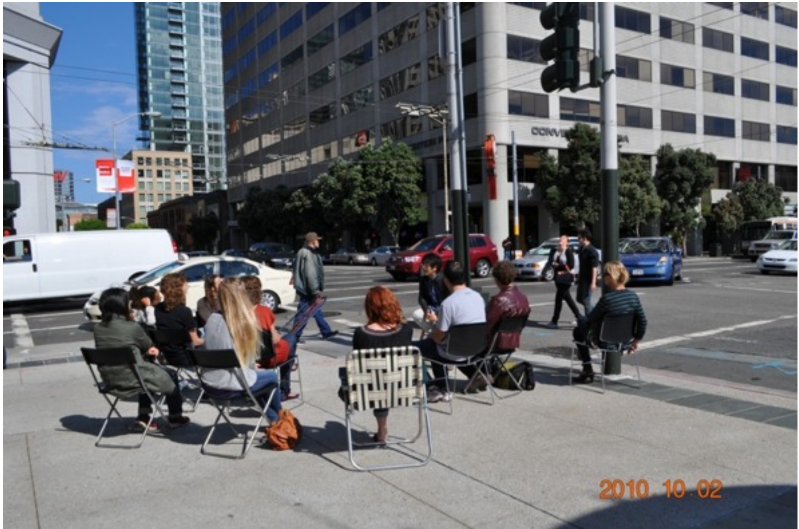
workshop, “names”, “chairs”, “Sparkling Water”