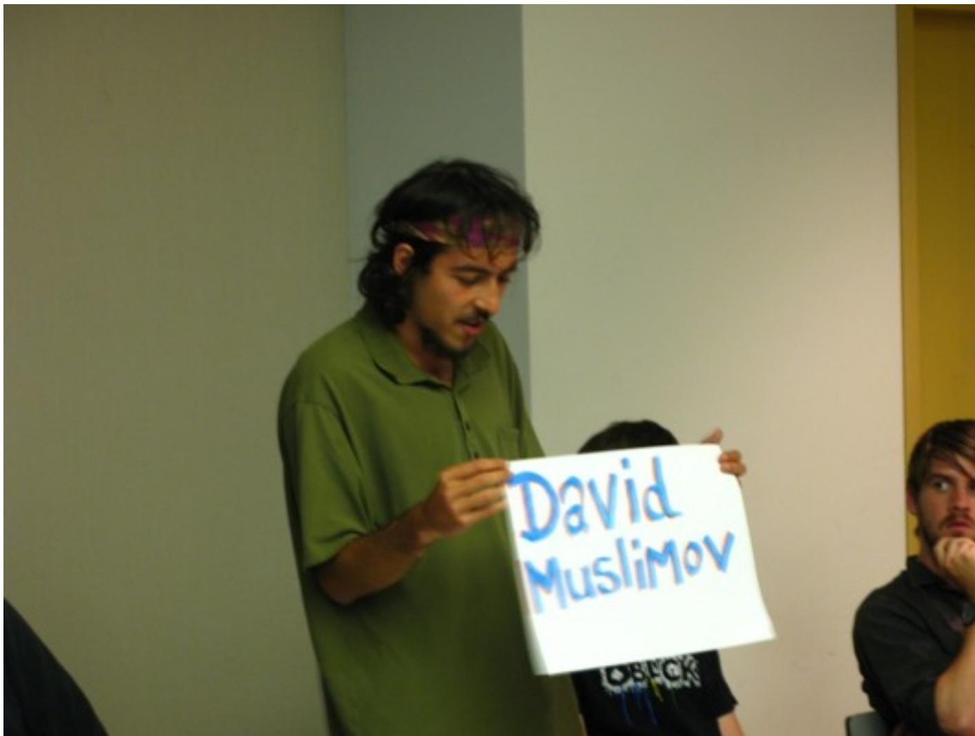
workshop, “names”, “chairs”, “Sparkling Water”