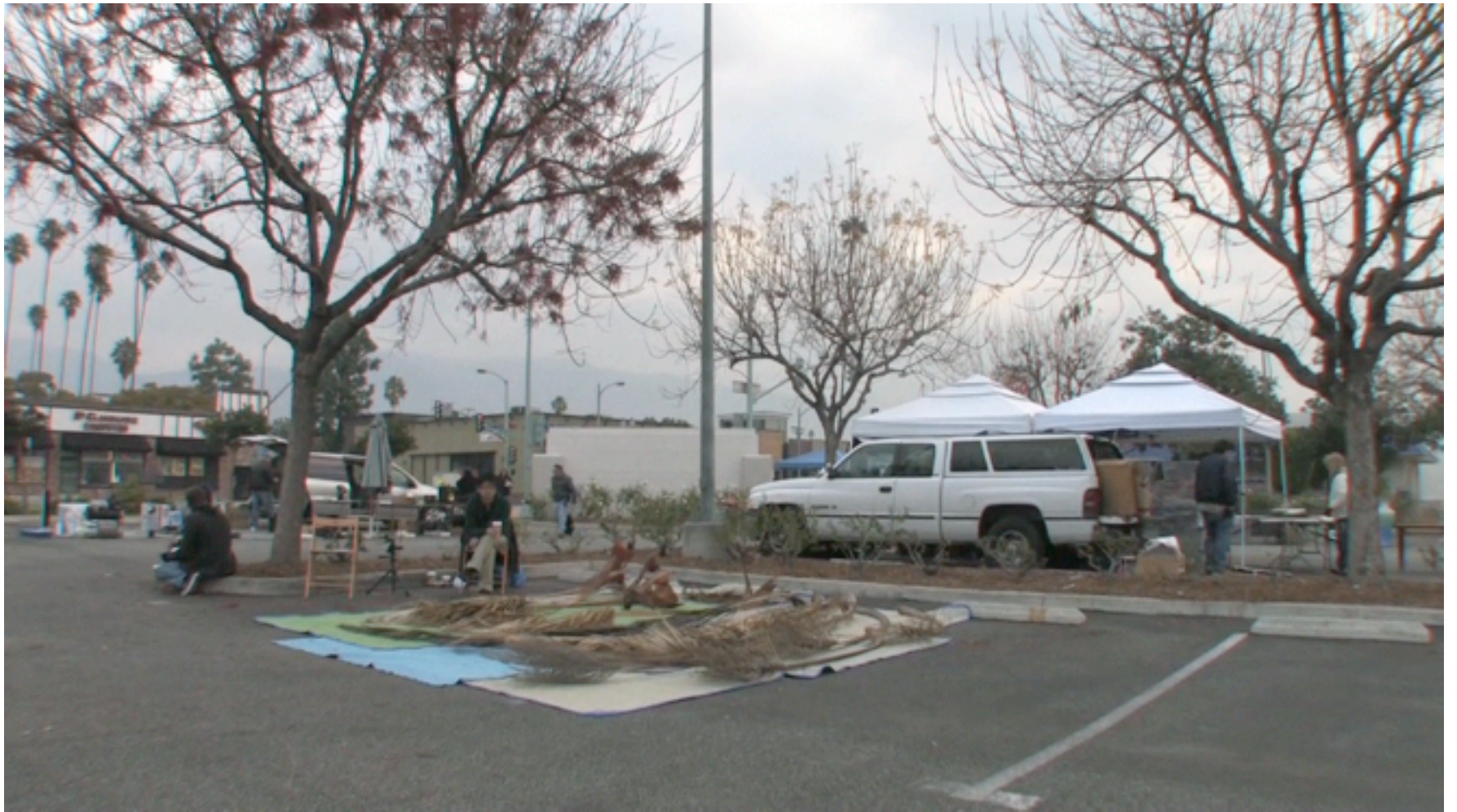
Someone's junk is someone else's treasure., 2011