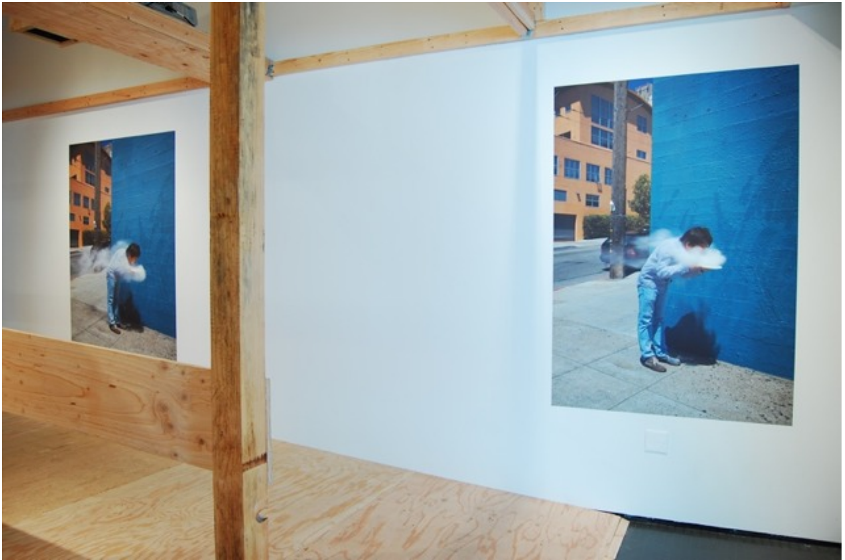
Nothing related, but something could be associated, Yerba Buena Center for the Arts, San Francisco, 2010