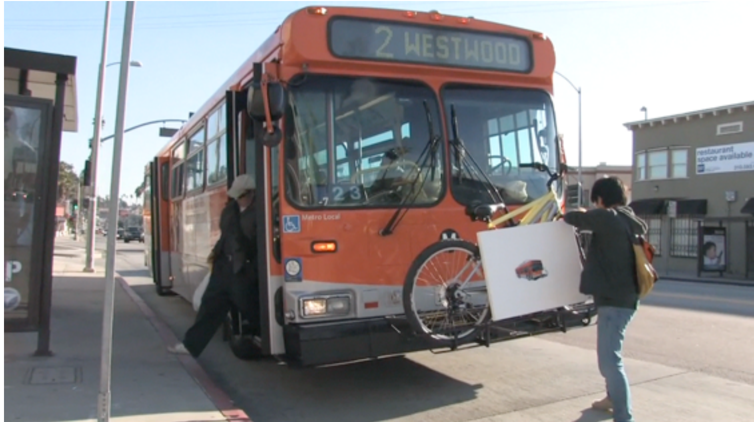
A painting to public (Metro Bus Line 2, Los Angeles), 2011