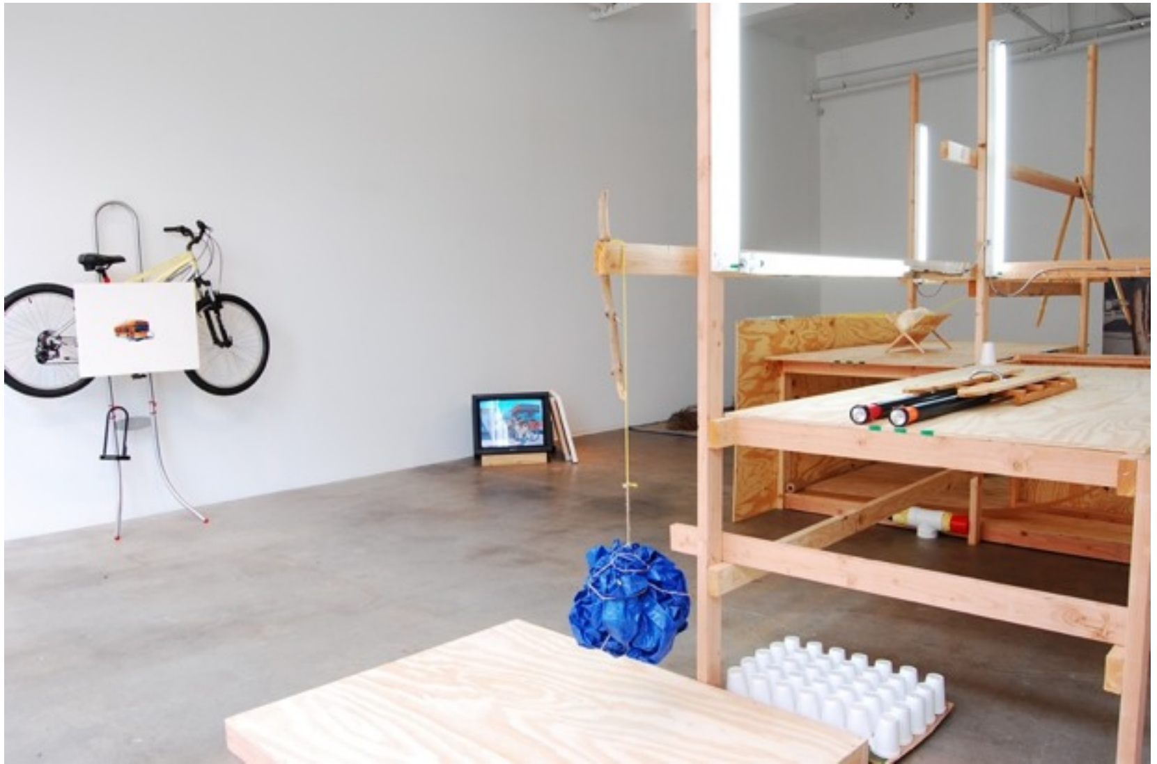
Dog, Bus, Palm Tree, 2011