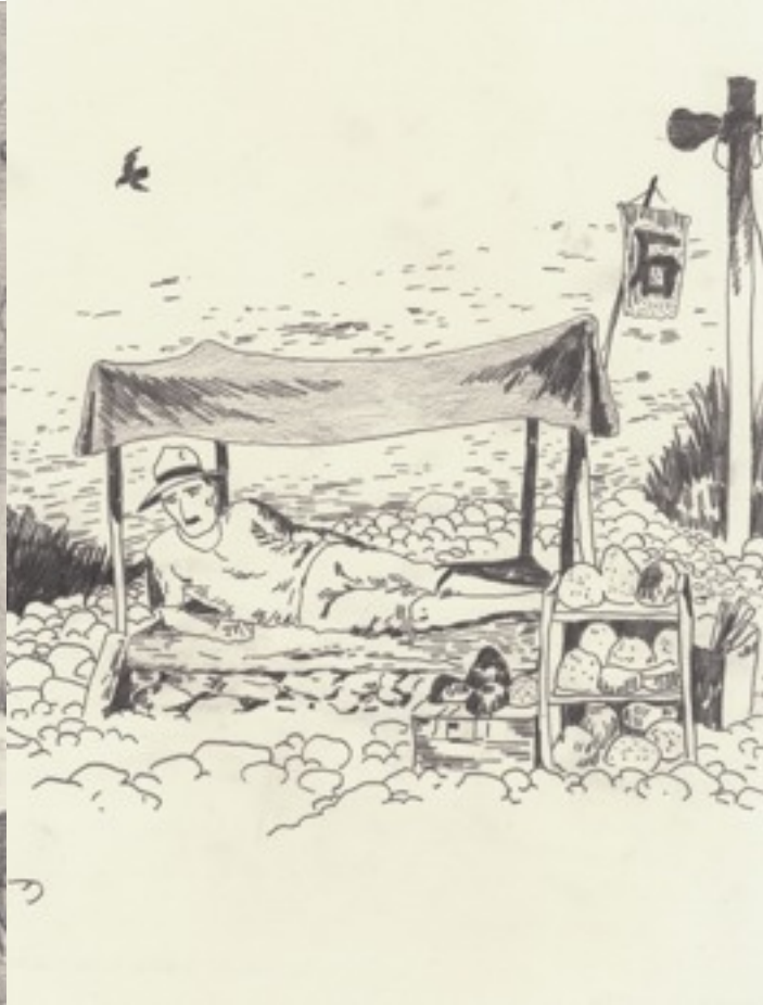
Someone's junk is someone else's treasure., 2011