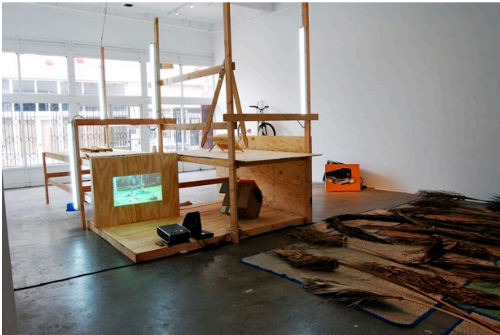
Dog, Bus, Palm Tree, 2011