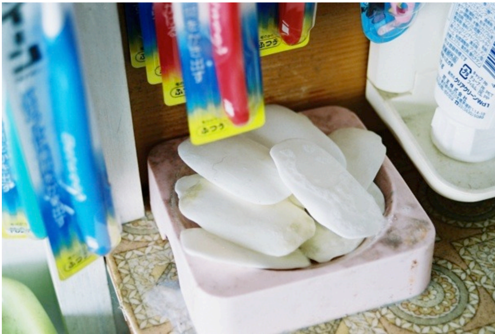
“Soaps in their hand” 2008