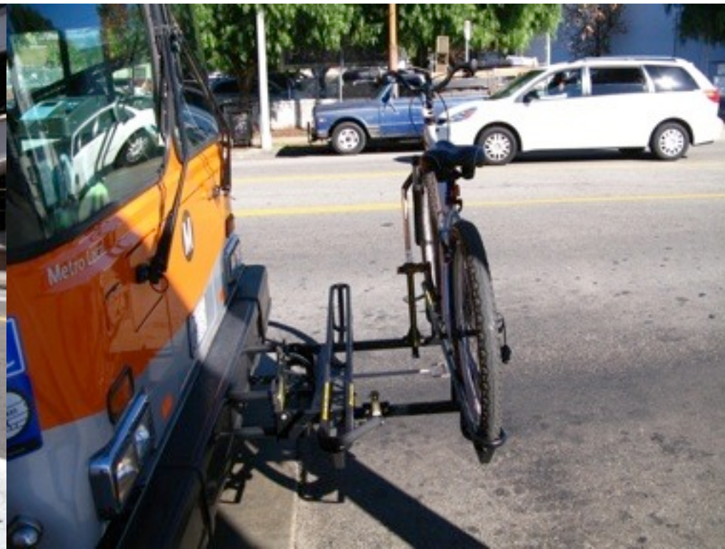
A painting to public (Metro Bus Line 2, Los Angeles), 2011