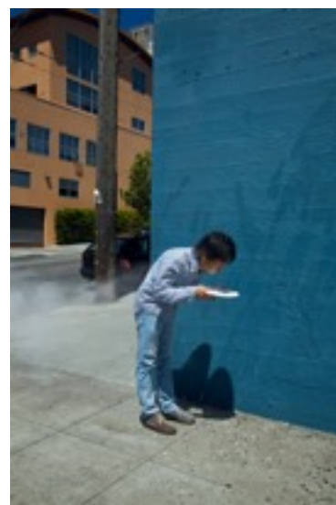
process of blowing flour, 2010