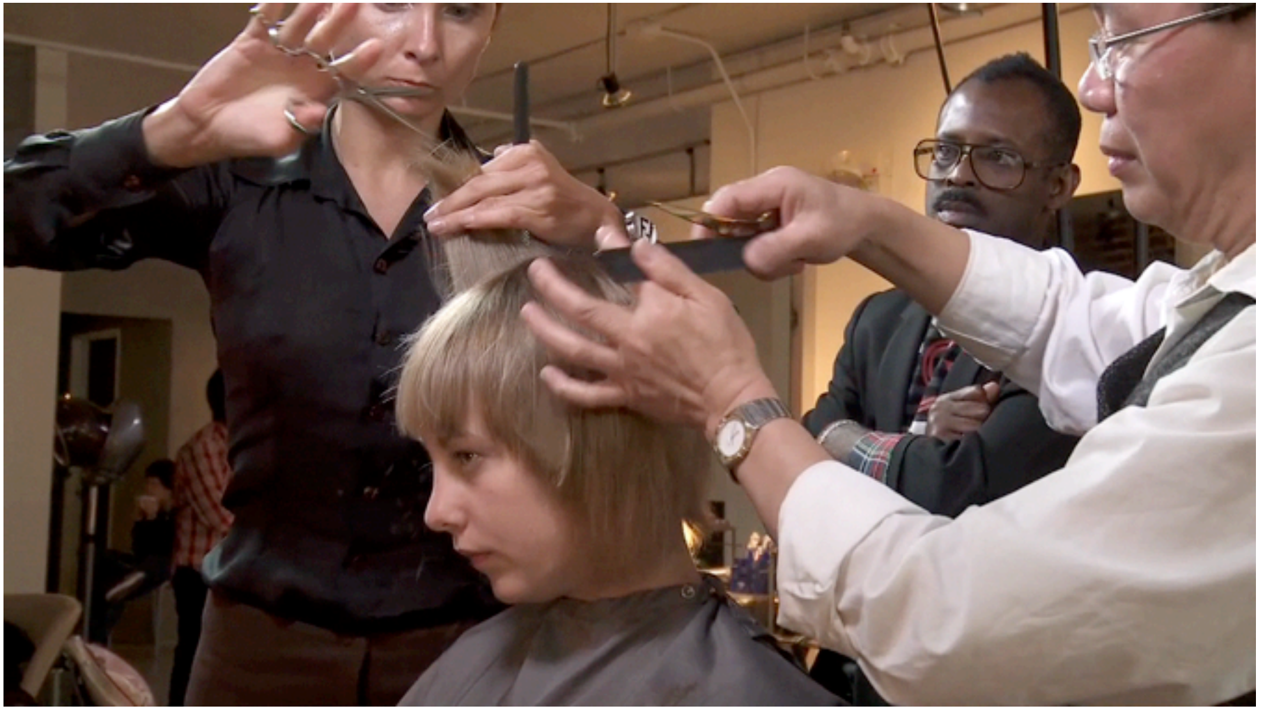
a haircut by 9 hairdressers at once (second attempt), 2010