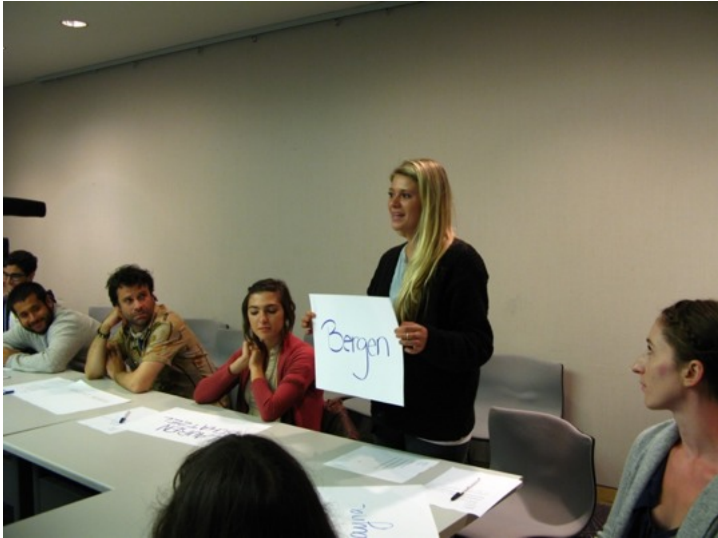
workshop, “names”, “chairs”, “Sparkling Water”